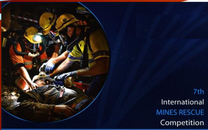
7th International MINES RESCUE Competition

That was the seventh competitions held within the framework of the International Mine Rescue Body.